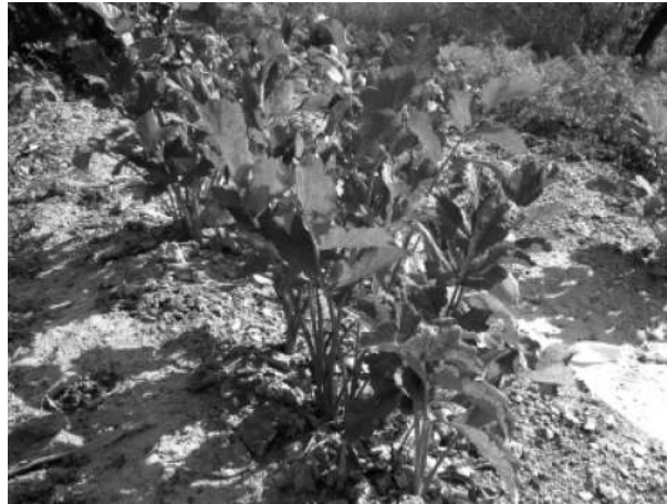
Magnification \times 0.2

If the seeds are sown too far apart, few will grow into adult plants and the crop will be poor. If they are sown too close together, few plants will emerge from the soil and the crop again is poor.